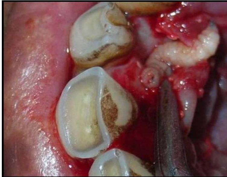
Figure 1. Larvae coming out of the periodontal pocket between teeth #21 and 22.