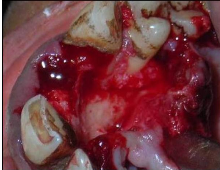
Figure 3. Open flap debridement did along with extraction of teeth #22.

5% povidine iodine solution and intensely searched for any remaining maggots. After ensuring that no more maggots were left, tooth number 22 was extracted as it was mobile (Figure 3) due to extensive damage caused by maggots. Then we replaced both flaps to their respective positions and sutured with 3-0 black silk and gave zinc oxide dressing.