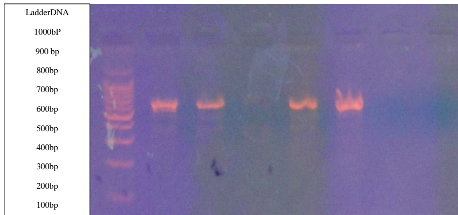
Figure 1. Gel electrophoresis result of multidrug resistant \beta -lactamase producing Staphylococcus aureus strains.