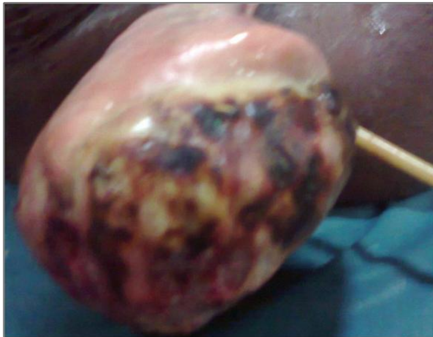
Figure 1. Inversion of uterus with fungating polypoidal growth protruding out of introitus.