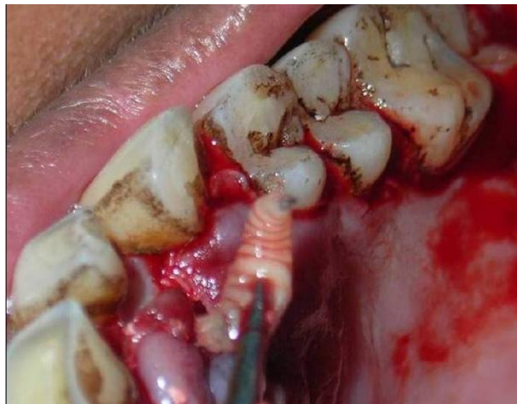
Figure 2. Palatal incision given for open flap debridement to look out for remaining maggots.

a maggot was seen coming out of the mouth of the periodontal pocket (Figure 1) Thus a provisional diagnosis of periodontal myiasis was made.